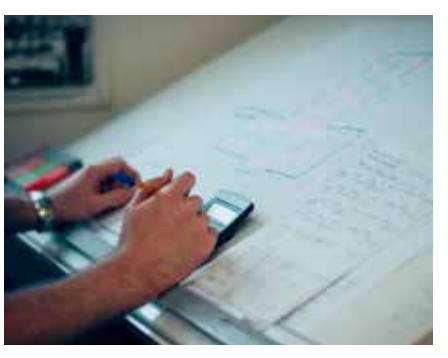
Quantify and design