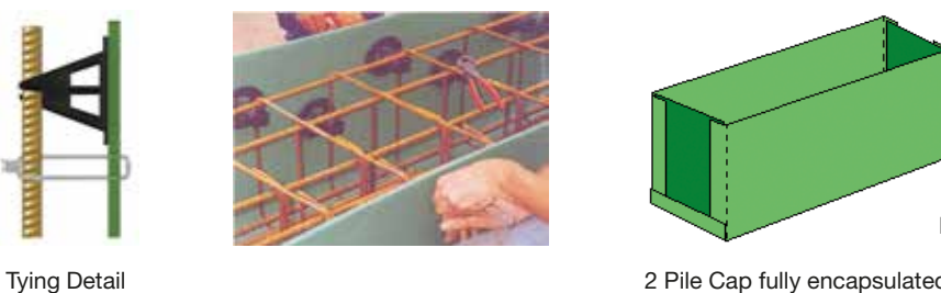
2 Pile Cap fully encapsulated.